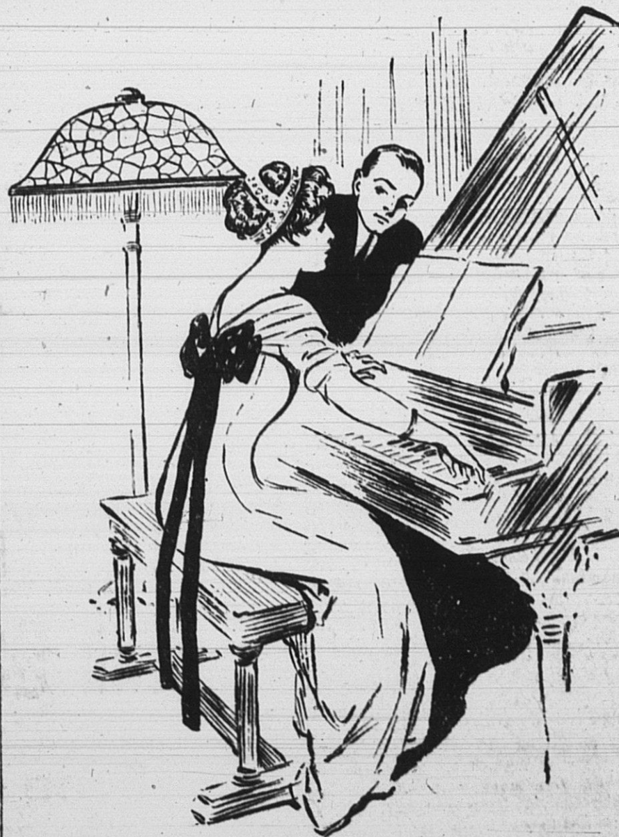
"Will You Sing It to Me Now?"

Meanwhile the Cup race was approaching. On the last evening before