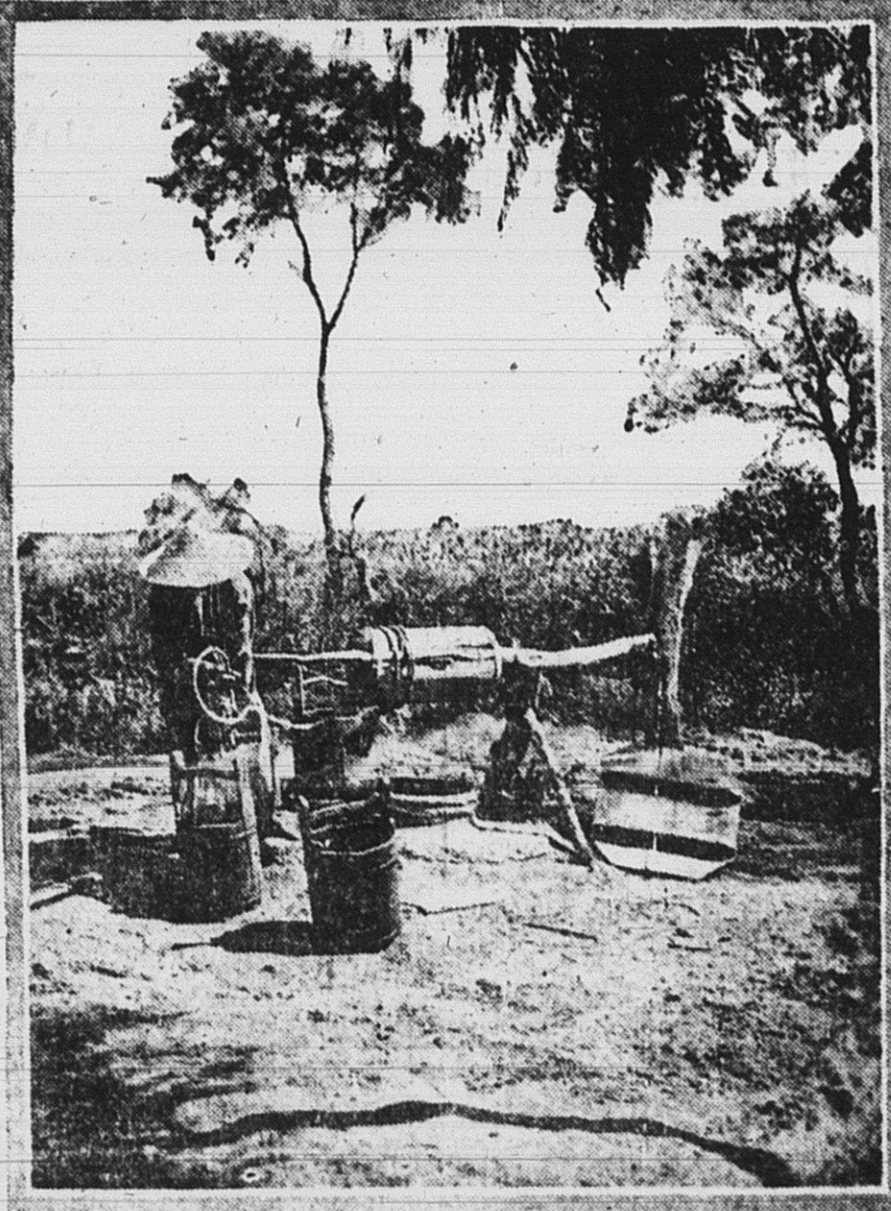
DRAWING WATER FROM A WELL

Powerful engines, heavy double tracks, Automatic Electric Block Safety Signals; smooth, dustless roadbed.