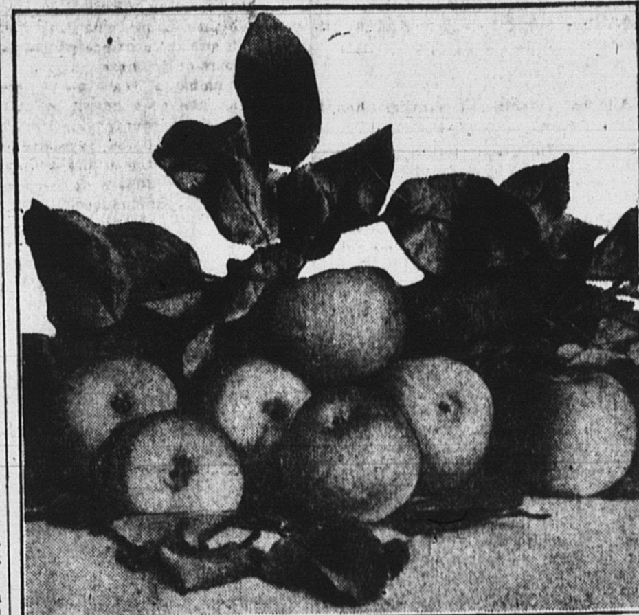
Showing the Good Effects of Spraying.

Common Mistake to Try to Economize in Purchase of Equipment for Eradication of Orchard Pests—Easy Matter for Farmer to Have Liberal Supply of Small Fruits.