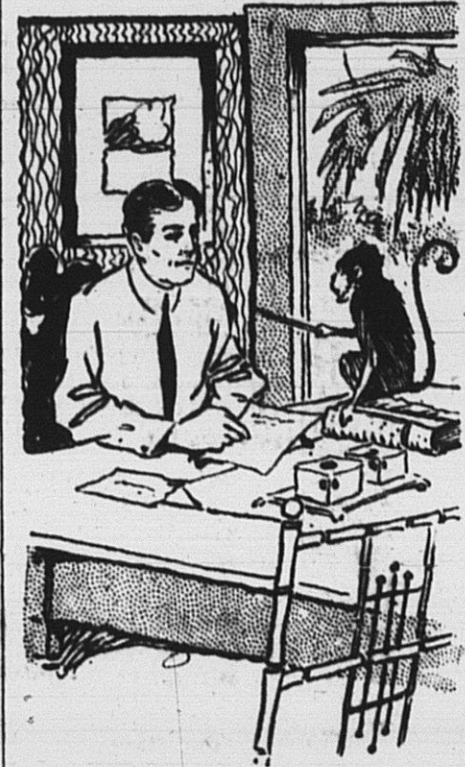
Held It Toward Him.

Then he sighed, for he had not written to Ada Ferris so regularly as he had been used to do. Perhaps it was because his promotion came slowly. It could not have been because of Lilith Aintree, Judge Aintree's daughter,